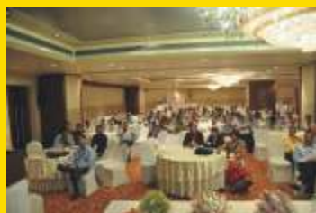
GHAZIABAD KSS, APRIL 2014