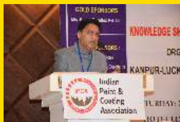
LUCKNOW KSS, DECEMBER 2014