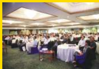
LUDHIANA KSS, AUGUST 2014