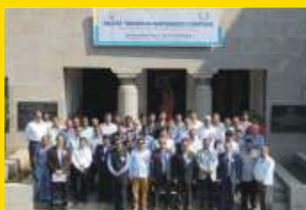
HYDERABAD KSS 2013