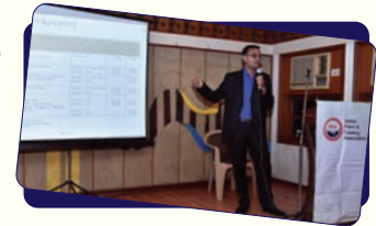
Budget Meet 2016