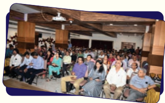
2 nd GST Seminar