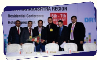
Residential Seminar Nashik