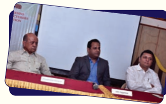
Budget Meet 2016