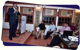
Budget Meet 2016