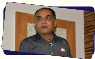
2 nd GST Seminar