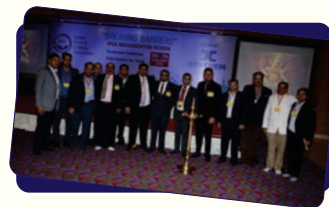
Residential Seminar Nashik