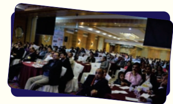
Residential Seminar Nashik