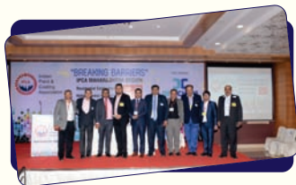
Residential Seminar Nashik