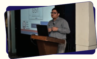
1 st GST Seminar