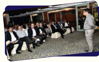
1 st GST Seminar